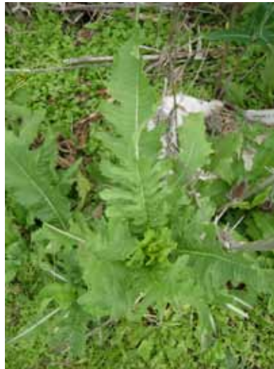
Leaf of young cut-leaved teasel plant.

Teasel grows in open, sunny habitats in from wet to dry conditions. Optimal conditions seem to be mesic. In Illinois, teasel sometimes occurs in high quality prairies, savannas, seeps, and sedge meadows, though roadsides, railroad tracks, dumps and other heavily disturbed areas are the most common teasel habitats. Teasel is often found in large stands of tall plants of similar height.