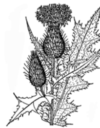
Bull thistle, an invasive similar to teasel.