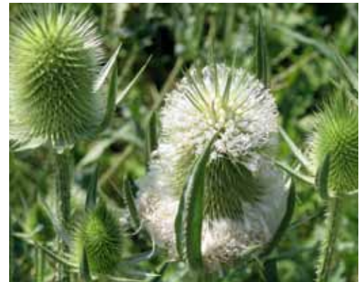
Cut-leaved teasel flower head.

Cut-leaved teasel normally has white flowers from July to September while common teasel produces purple blooms from June to October. Stiff, spiny, leaf-like structures called bracts curve up from the base of the flower head. A single teasel plant produces more than 2,000 seeds which remain viable for several years. The seeds disperse in close proximity to the parent plant but can be transported longer distances by water or on mowing equipment.