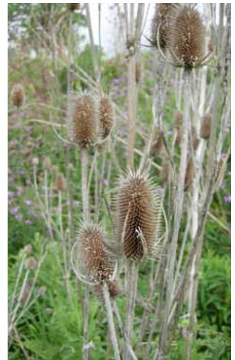
Previous season's teasel.