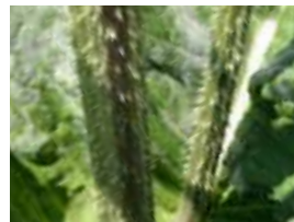
Spiny teasel stems.