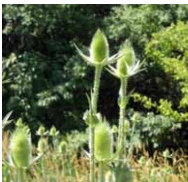
Field of teasel.