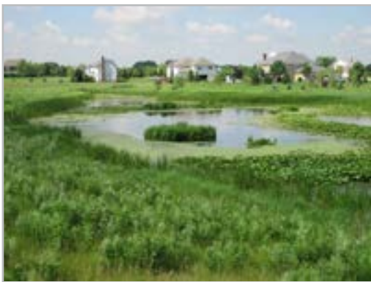
Long Slough.

The large wetland with floating islands to the east of Gravel Hill Two is Long Slough. The Merriam Webster's dictionary defines a slough as a "place of deep mud"; any volunteer who walked across the dried bottom of Long Slough last summer will attest to the accuracy of that description. Webster's second meaning is a "creek in a marsh." Perfect! That is exactly what the wetland mitigation is - creek water is cleaned, stored and moderated by running through the vegetated marsh.