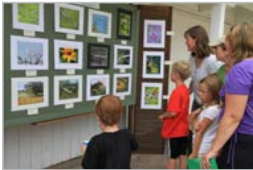
Photo contest entries.