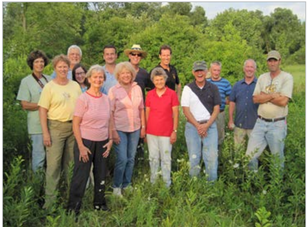
CFC Board of Directors at Craftsbury Preserve.