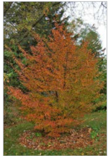
Very young blue beech in fall.