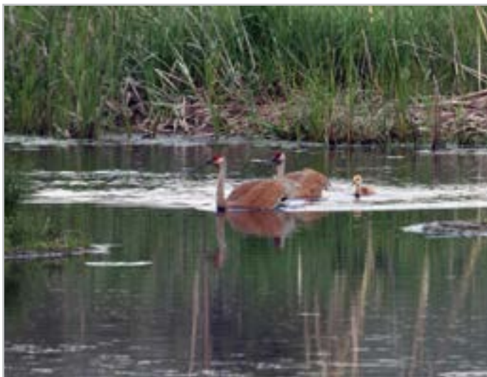
Formerly endangered sandhill cranes now thrive at Flint Creek Savanna.

The whooping crane may be the best known species saved by the Act, and those of us in the Barrington area who thrill to the return of sandhill cranes each spring appreciate the grandeur of the crane genus. The whooper, tallest and grandest bird in the United States, had dropped to twenty-one individuals in 1938. Unregulated hunting and habitat loss reduced their numbers until it was listed as endangered when there were forty-eight wild and six captive birds. The Endangered Species Act designated critical habitat in Idaho, Kansas, Nebraska, Oklahoma, and Texas. The bird now nests in the wild only in Wisconsin, Central Florida, and Canada. Through habitat management, nest protection, captive breeding, and reintroductions, the population had increased