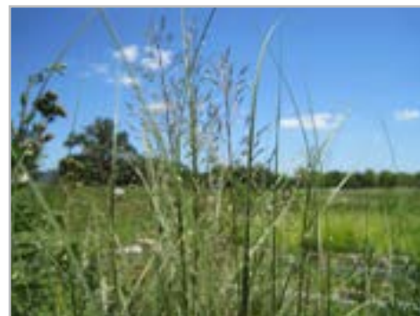
Prairie dropseed at FCS displays its popcorn-scented seeds.

If you visit Flint Creek Savanna and understand the expertise, thousands of volunteer hours and perseverance it takes to create such a spectacular restoration, you will appreciate why it received an award for excellence in restoration from the U.S.