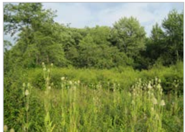
View looking east toward the uplands of the Craftsbury Preserve. Teasel in the foreground is one of the restoration challenges for future workdays.