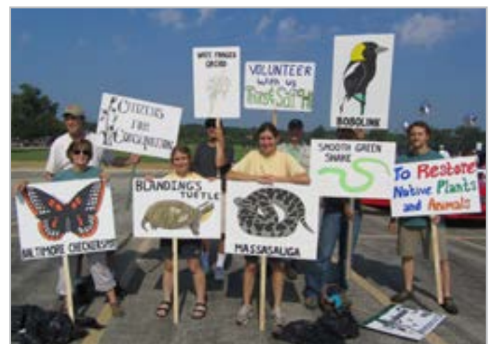
CFC interns join volunteers to march in Barrington's 4th of July parade.