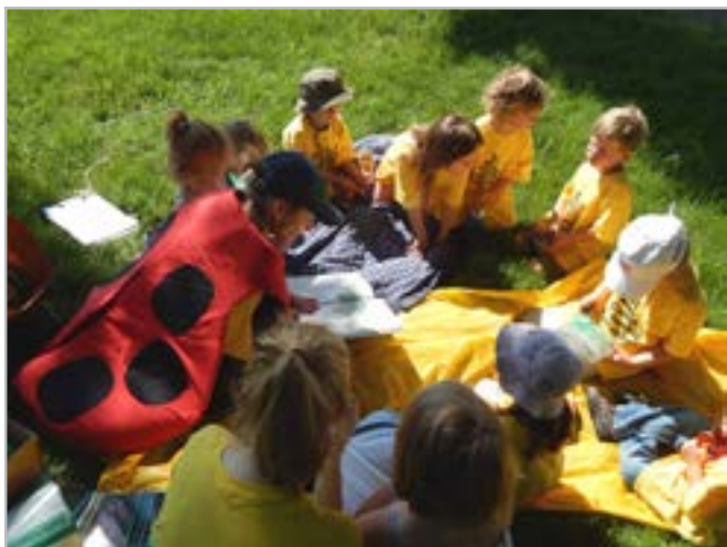
Ladybug leader gives insect session at camp.

Leaders and children learned about plants and trees and the growing process by planting their own seeds for growing at home. Tuesday was all about mammals with children learning what a mammal is, experiencing mammal skulls and pelts, and making a mammal puppet. Wednesday was “for the birds” as we discussed what birds are in our backyards and how they fly, while creating art with feathers. Thursday was about insects as children enjoyed a bug hunt