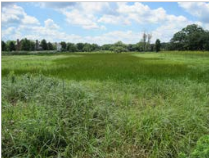
East Side Marsh.

South of Swink Prairie is the East Side Marsh — CFC's best established matrix of sedge meadow, bur reed marsh and wet prairie. Due south of Original Grove is the Golden Triangle. It contains our most mature mesic prairie bordered by the diagonal wet prairie of the East Side Marsh, the south border of Original Grove and the north-south running border of