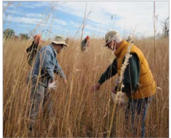
Experienced and new volunteers gather seed on Make A Difference Day.

On Make A Difference Day, the nation's largest day of community service, millions of volunteers across the country worked to improve the quality of life in their communities. At Citizens for Conservation, families, friends, youth and community groups composed of experienced as well as new volunteers gathered the seed of native plants at CFC's Grigsby Prairie. CFC workers processed that seed along with all of the other seed gathered during many seed collecting workdays this fall. CFC volunteers cleaned, weighed and mixed all of it for various ecosystems, and it was sown in appropriate areas of local restorations. That planting was completed by the end of November.