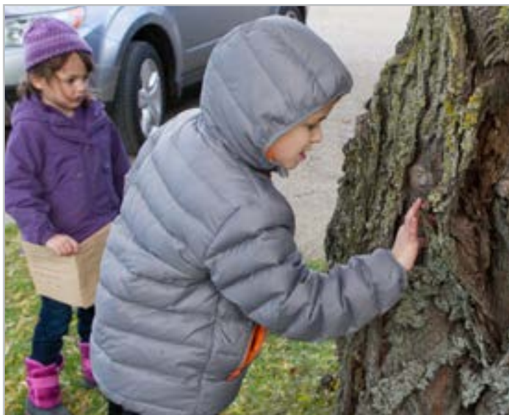
Team members find a cache at geo-caching event.

Teams quickly learned that working together was important in finding the caches. Some caches were easy to find like a “rock” close to the front of a building while others were difficult to spot such as the cache in the small hole of a split rail fence. It was fun to watch parents and children work diligently and secretly (so the other teams didn’t see where they had found a cache). Participants could see the general location of the other teams but had to use the GPS units and clues to locate the tiny caches.