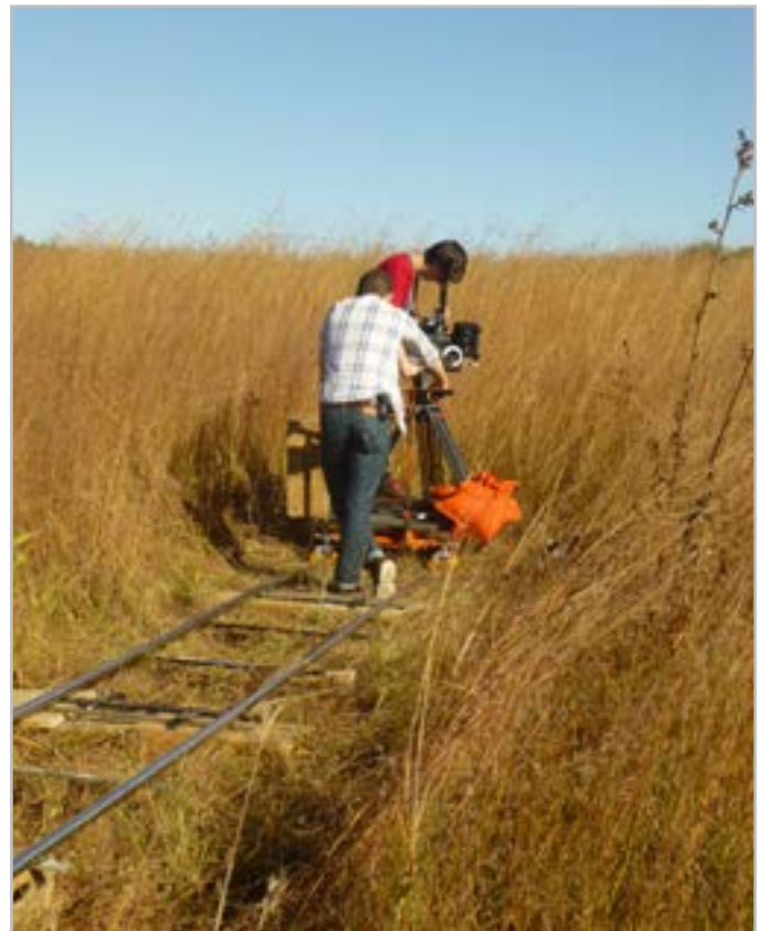
Grigsby Prairie stars in student film.

Registration is now open for CFC Youth Education’s January 11 class “Raptors – Birds of Prey.” Contact youth-ed@citizensforconservation.org or call 847-382-SAVE (7283).