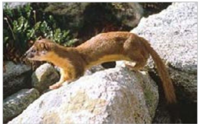
Long-tailed weasel.

Let's keep restoring living space for living things. It appears to be working wonderfully!