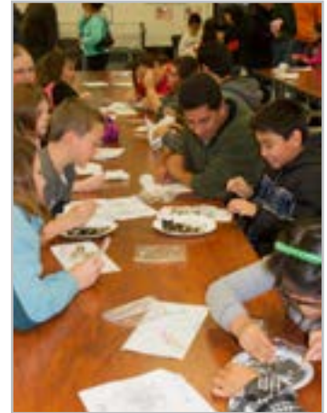
Students dissect owl pellets.

With a grant from the Barrington Junior Women's Club to help offset costs and with the approval from D220 Sunny Hill Elementary School, we could teach students about owls. Children from grades one through five were randomly selected to take part in this free educational opportunity. We also invited family members and other caregivers to join us, providing an occasion for the whole family to share and enjoy.