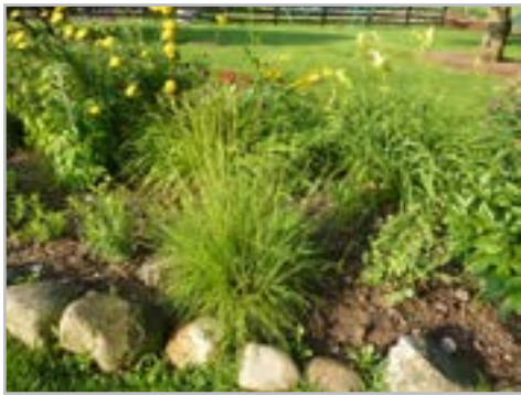
Little bluestem in August.

Ground feeding birds and finches use native grasses for seeds and protection. Finches also will feed on Rudbeckia (black-eyed and other Susans) as well as Echinacea (purple and pale purple coneflowers).