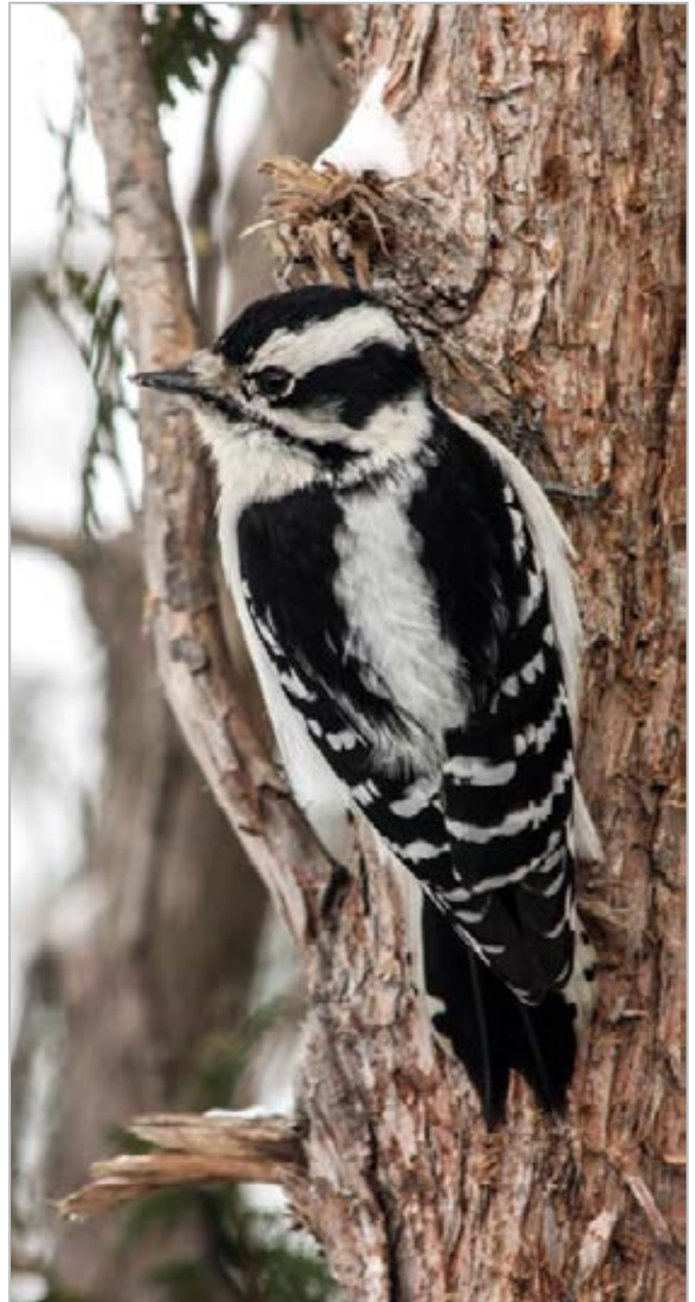
Female downy woodpecker.