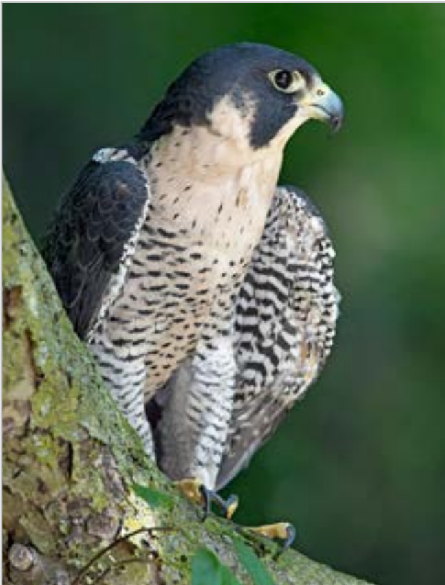
Peregrine falcon.

In contrast, the woodcock likes wet but open woods. We had never seen this instantly identifiable bird even though Flint Creek is right in the heart of its range. I think the woodcock stayed away until the tangles of thorns were cleared. I hypothesize that dense branches interfere with the woodcock's explosive getaway flight.