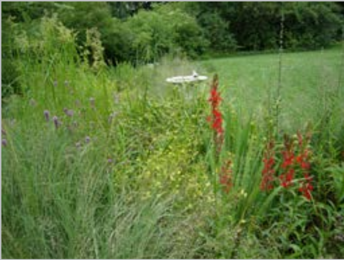
Toad habitat in a rain garden displaying cardinal flower and narrow-leaved loosestrife, a native.

I had many toads in my land-bound yard this year, probably the product of my rain garden during a wet spring and summer. However, if we have another dry year in 2014, the toads will be unable to breed on my property. How nice it would be if my next door neighbor had a pond or other water feature to which my toads could hop for breeding habitat. Corridors provide options for struggling wildlife.