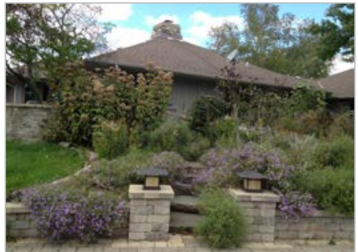
Pollinator habitat in a hillside garden with asters in front, blazing stars behind and Joe Pye weed in back.

to preserve and protect as natural land, the amount of such available acreage is shrinking daily. There is less and less suitable property for storing rainwater on site, for providing bird and invertebrate habitat, and for spacious preserves. However, there is an almost endless untapped source of such property privately owned in the area. We mean your yard! Putting together many yards with healthy habitat, residents, friends, and neighbors can create a “national park” of sorts that protects our water table, air quality, native plants, and wildlife for everyone to enjoy.