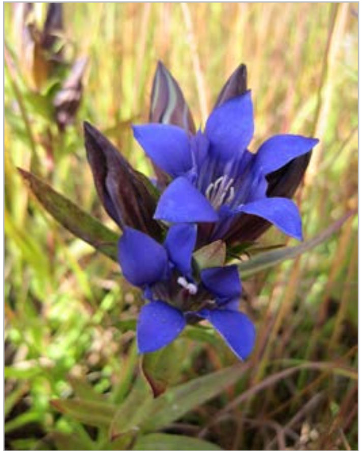
Prairie gentian at Grigsby Prairie.