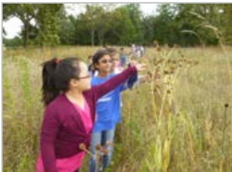
Rattlesnake master captivates fourth grade citizen scientists on a discovery walk at Spring Creek.