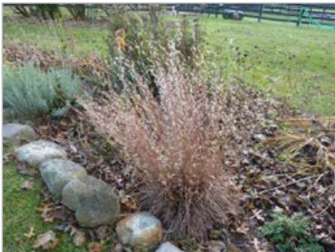
The same little bluestem plant in November.