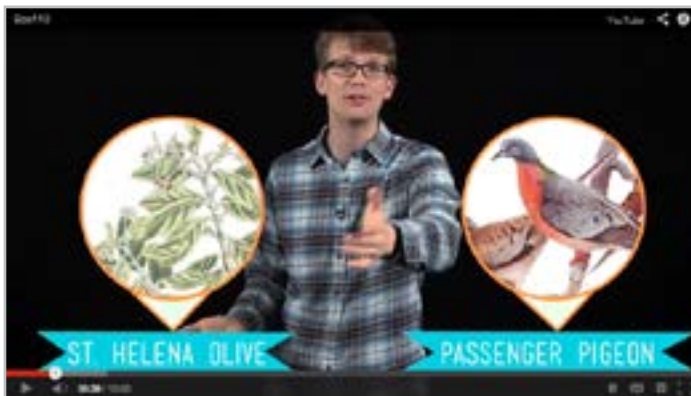
Screen shot from Khan Academy's program — 5 Human Impacts on the Environment.

I decided to search "Environmental Science." I uncovered numerous lessons that were clearly formatted with easy-to-understand information that both children and adults can use to enhance their knowledge of environmental issues. I chose to access the discussion on Conservation Biology and Restoration Ecology. The discussion features a description of the recovery of the Clark Fork River in Missoula, MT.